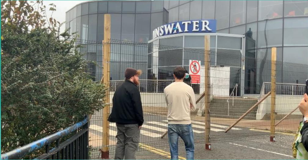
Sure Start East Belfast Youth Group Film 'Now and Then'